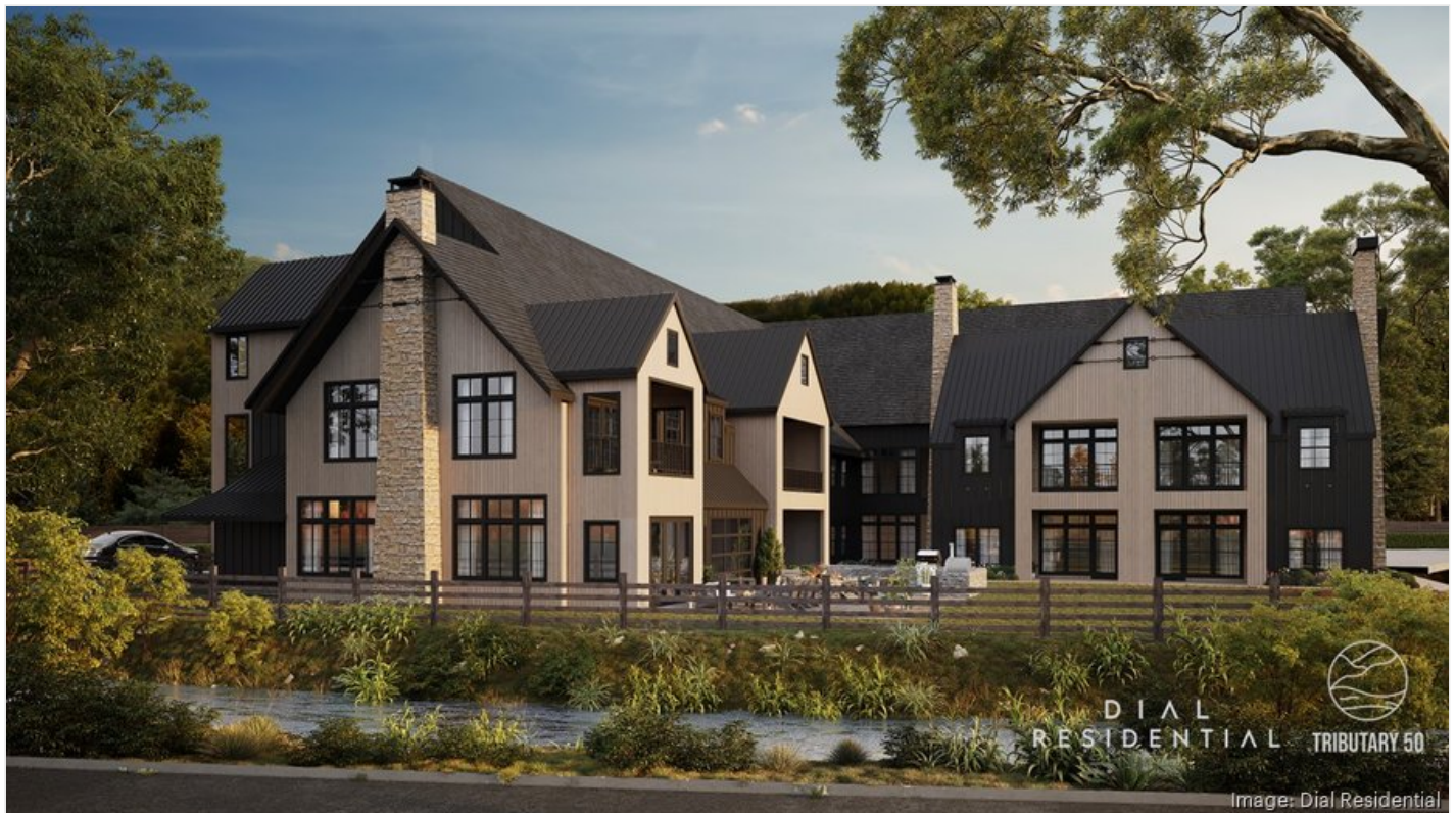
A rendering of Tributary 50, a 27-unit boutique development, in Columbia Township.